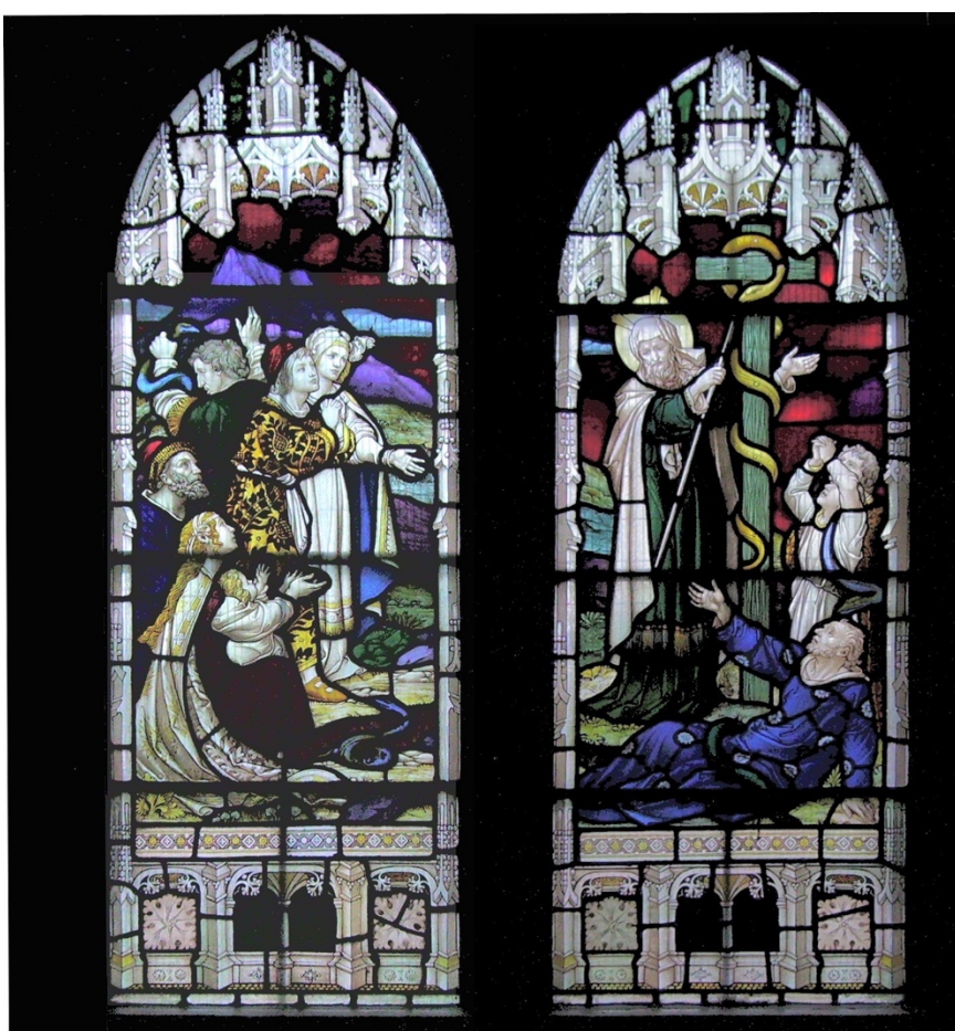
Figure 1. Moses and the Brazen Serpent, ca. 1866.

An Old Testament KnoWhy1 relating to the reading assignment for Gospel Doctrine Lesson 15: "Look to God and Live" (Numbers 11-14; 21:1-9) (JBOTL15A)