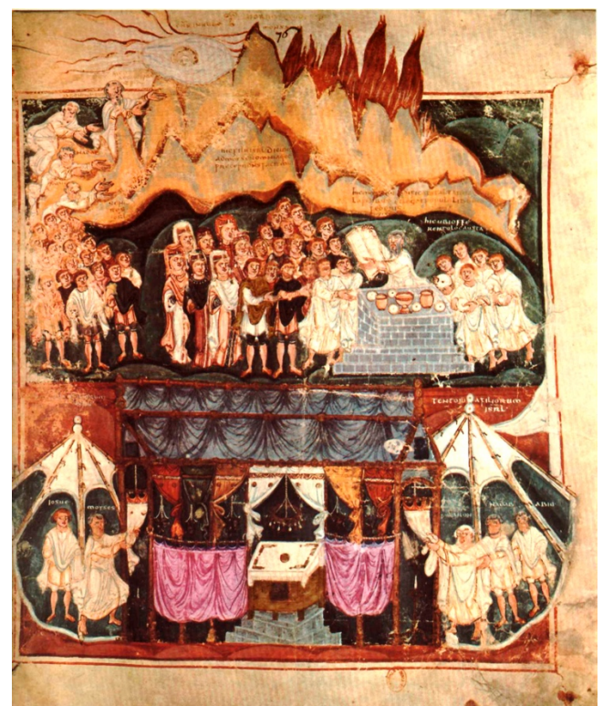
Figure 8. Mount Sinai and the Christianized Tabernacle, ca. 60096

feast at the divine table.93 Note that in contemporaneous Jewish writings, Moses was described not only as a prophet, priest, and king, but also (like Jesus) as a god, having been "changed into the divine" through his initiation into the "mysteries."94 Like Jesus, Moses was described as one who leads his disciples through these same mysteries so that they could also see God.95