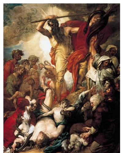
Figure 3. Benjamin West (1738–1820): The Brazen Serpent

[However], it has to be admitted that the hypothesis presented above, which associates the cultic Canaanite serpents with Horon (Eshmun?), has its weak point. The problem is a lack of any textual source that would directly connect Horon with the bronze serpents. ... Until such a text is found, the above identification has to be treated as ... hypothetical.