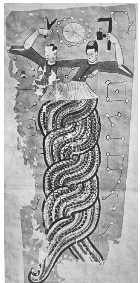
Figure 4. Fu Xi with His Consort Nü Gua, ca. 689 CE

With regard to the theme of opposition on the pathway to exaltation — and though there is no known connection at all to the symbology of the brazen serpent in the ancient Near East —this depiction of Fu Xi and Nü-Gua is of interest. Many images similar to this one have been found in tombs dating back to the second century BCE. Fu Xi and Nü Gua, are shown measuring the "squareness of the earth' and the 'roundness of heaven' with their implements, the square with the plumb bob hanging from it, and the compass."30