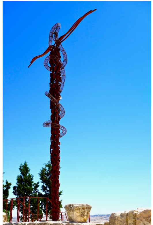
Figure 5. Giovanni Fantoni: The "Serpentine Cross" atop Mount Nebo (Khirbet as-Sayagha), Jordan, 1984. The sculpture is distant from the place where the serpent story in Numbers occurred. Instead, it was placed on Mount Nebo where Moses was once granted a view of the Promised Land.44 Photograph by Jeffrey M. Bradshaw45

Nibley noted that "the garment draped over the coffin and the veil hung on the wall had the same marks; they were placed on the garment as reminders of personal commitment, while on the veil they represent man's place in the cosmos."38 "The whole design is completely surrounded with diagrams of the constellations[—including the Big Dipper39], while above the heads of the two figures 'is the sun disc, white with red spokes,' surrounded by twelve smaller circles,40 each connected to the next by a straight line to form an unbroken circle except at the very top where it is left open—plainly the circle of the months of the year"41 — "meaning … the navel of the universe."42 The moon disk appears beneath the entwined bodies, also surrounded by twelve smaller circles. In the late Babylonian period, intertwining serpents represented the union of the sun and moon.43